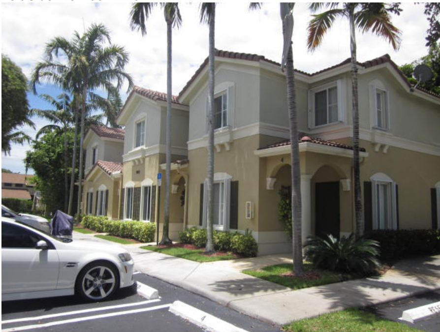
Front View 06/14/2014