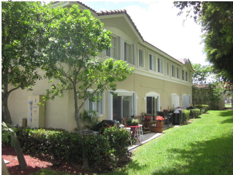
Rear View 06/14/2014