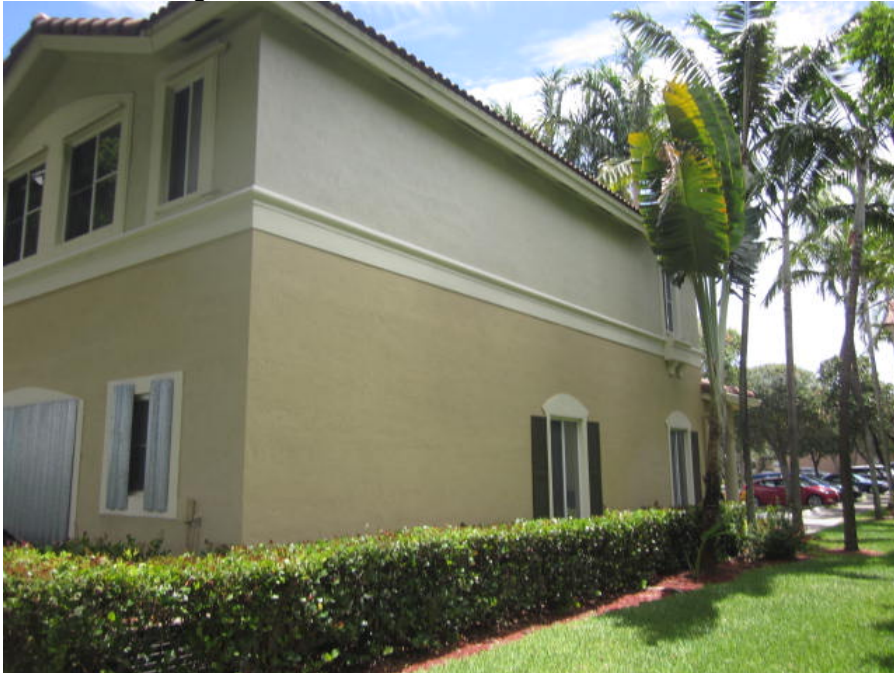
Left Side View 06/14/2014

If using the Elevation Certificate to obtain NFIP flood insurance, affix at least 2 building photographs below according to the instructions for Item A6. Identify all photographs with: date taken; "Front View" and "Rear View"; and, if required, "Right Side View" and "Left Side View". When applicable, photographs must show the foundation with representative examples of the flood openings or vents, as indicated in Section A8. If submitting more photographs than will fit on this page, use the Continuation Page.