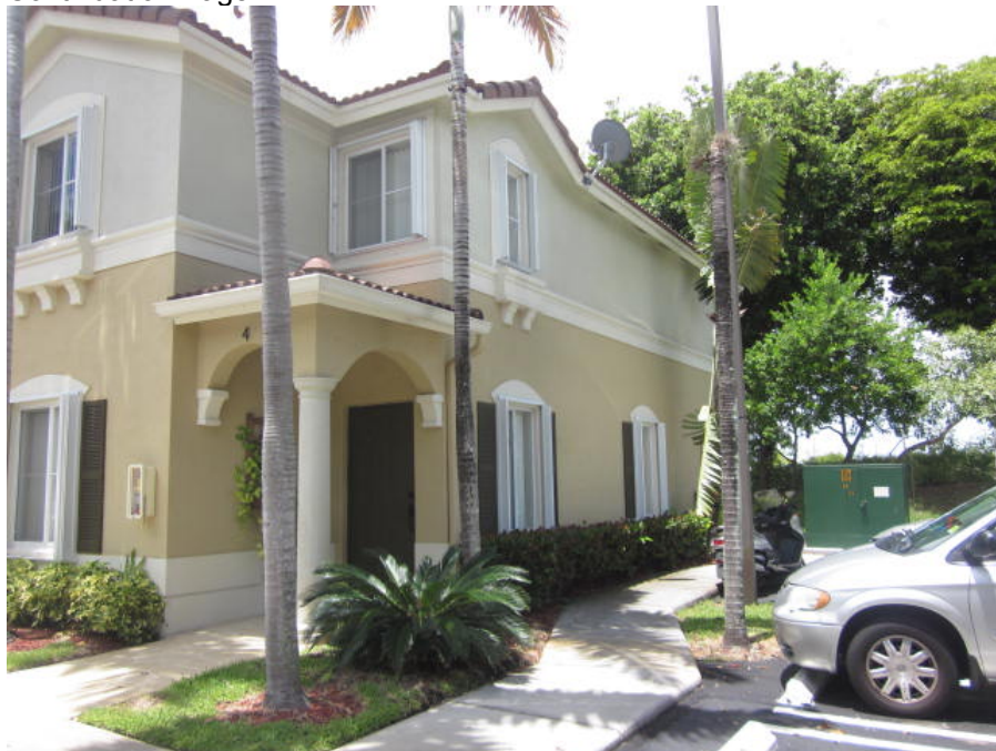
Right Side View 06/14/2014

If using the Elevation Certificate to obtain NFIP flood insurance, affix at least 2 building photographs below according to the instructions for Item A6. Identify all photographs with: date taken; "Front View" and "Rear View"; and, if required, "Right Side View" and "Left Side View". When applicable, photographs must show the foundation with representative examples of the flood openings or vents, as indicated in Section A8. If submitting more photographs than will fit on this page, use the Continuation Page.