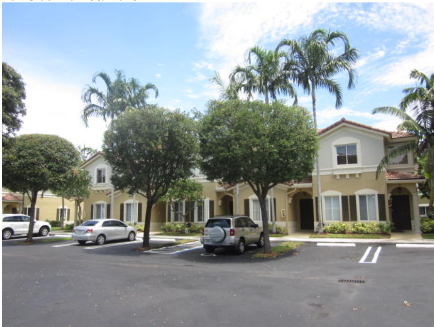
Front View 06/14/2014