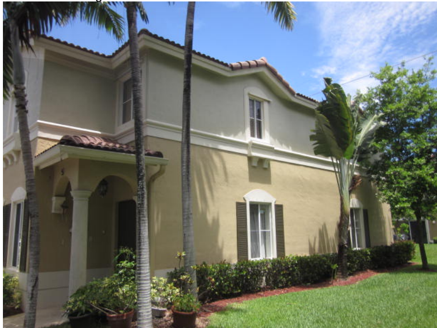
Right Side View 06/14/2014

If using the Elevation Certificate to obtain NFIP flood insurance, affix at least 2 building photographs below according to the instructions for Item A6. Identify all photographs with: date taken; "Front View" and "Rear View"; and, if required, "Right Side View" and "Left Side View". When applicable, photographs must show the foundation with representative examples of the flood openings or vents, as indicated in Section A8. If submitting more photographs than will fit on this page, use the Continuation Page.