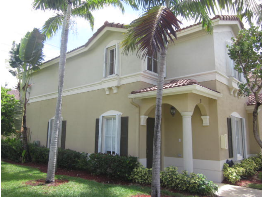
Left Side View 06/14/2014

If using the Elevation Certificate to obtain NFIP flood insurance, affix at least 2 building photographs below according to the instructions for Item A6. Identify all photographs with: date taken; "Front View" and "Rear View"; and, if required, "Right Side View" and "Left Side View".When applicable, photographs must show the foundation with representative examples of the flood openings or vents,as indicated in Section A8. If submitting more photographs than will fit on this page, use the Continuation Page.