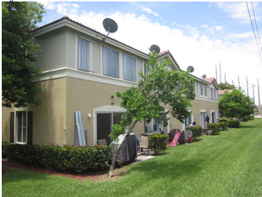
Rear View 06/14/2014