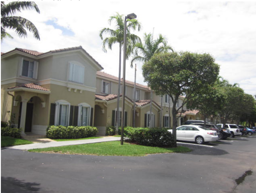
Front View 06/14/2014