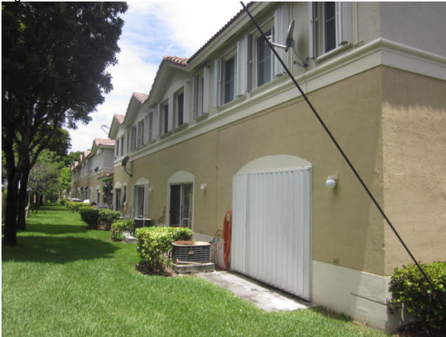
Rear View 06/14/2014