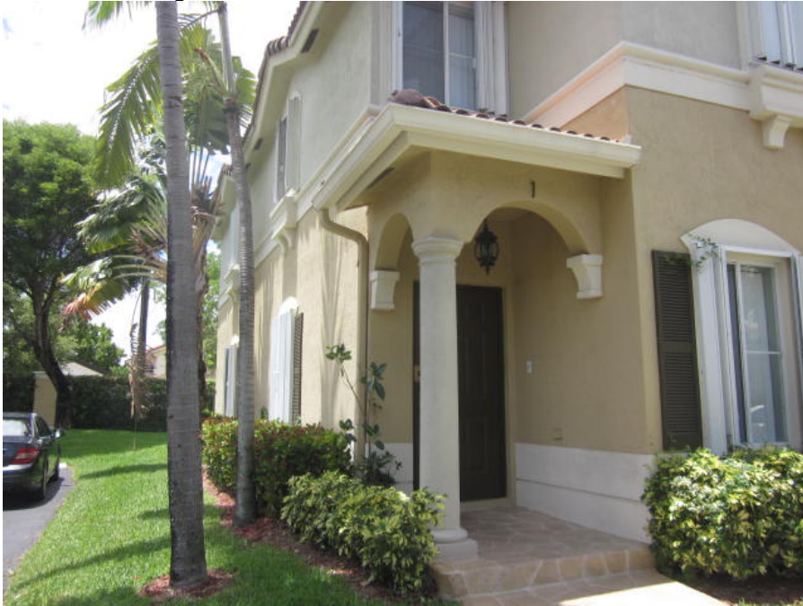
Left Side View 06/14/2014

If using the Elevation Certificate to obtain NFIP flood insurance, affix at least 2 building photographs below according to the instructions for Item A6. Identify all photographs with: date taken; "Front View" and "Rear View"; and, if required, "Right Side View" and "Left Side View". When applicable, photographs must show the foundation with representative examples of the flood openings or vents, as indicated in Section A8. If submitting more photographs than will fit on this page, use the Continuation Page.