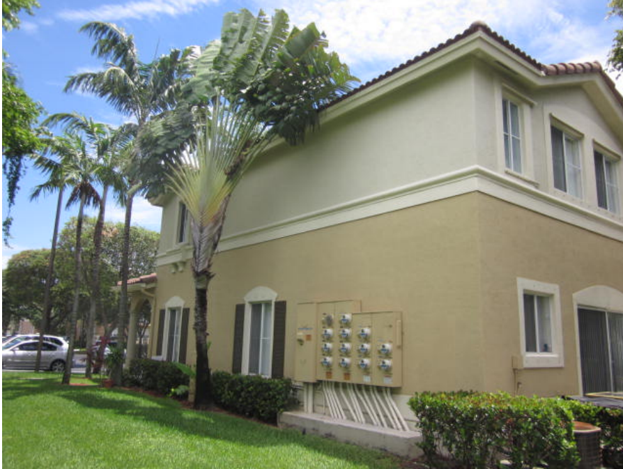
Right Side View 06/14/2014

If using the Elevation Certificate to obtain NFIP flood insurance, affix at least 2 building photographs below according to the instructions for Item A6. Identify all photographs with: date taken; "Front View" and "Rear View"; and, if required, "Right Side View" and "Left Side View". When applicable, photographs must show the foundation with representative examples of the flood openings or vents, as indicated in Section A8. If submitting more photographs than will fit on this page, use the Continuation Page.