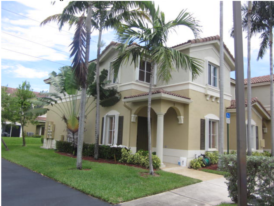
Left Side View 06/14/2014

If using the Elevation Certificate to obtain NFIP flood insurance, affix at least 2 building photographs below according to the instructions for Item A6. Identify all photographs with: date taken; "Front View" and "Rear View"; and, if required, "Right Side View" and "Left Side View". When applicable, photographs must show the foundation with representative examples of the flood openings or vents, as indicated in Section A8. If submitting more photographs than will fit on this page, use the Continuation Page.