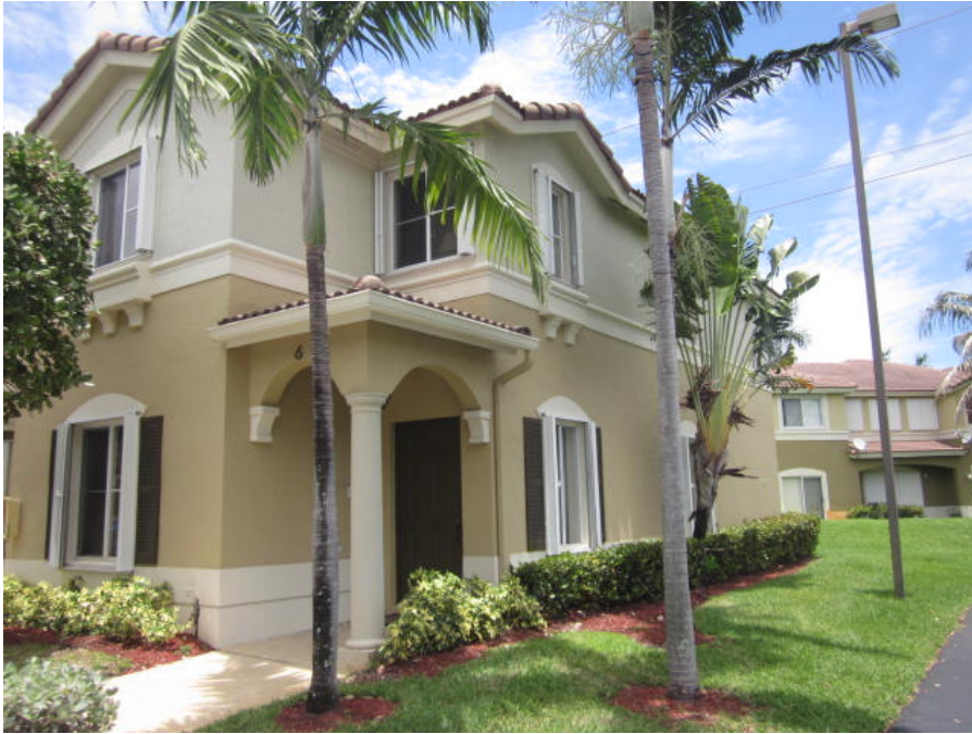
Right Side View 06/14/2014

If using the Elevation Certificate to obtain NFIP flood insurance, affix at least 2 building photographs below according to the instructions for Item A6. Identify all photographs with: date taken; "Front View" and "Rear View"; and, if required, "Right Side View" and "Left Side View". When applicable, photographs must show the foundation with representative examples of the flood openings or vents, as indicated in Section A8. If submitting more photographs than will fit on this page, use the Continuation Page.