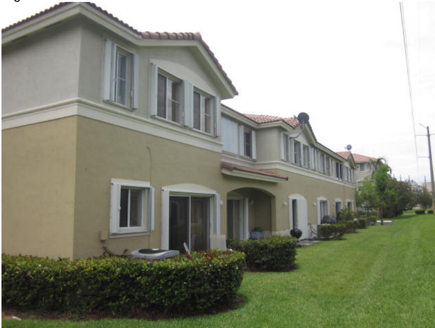
Rear View 06/14/2014