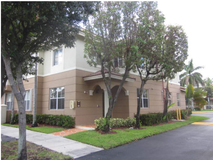
Right Side View 06/14/2014

If using the Elevation Certificate to obtain NFIP flood insurance, affix at least 2 building photographs below according to the instructions for Item A6. Identify all photographs with: date taken; "Front View" and "Rear View"; and, if required, "Right Side View" and "Left Side View". When applicable, photographs must show the foundation with representative examples of the flood openings or vents, as indicated in Section A8. If submitting more photographs than will fit on this page, use the Continuation Page.