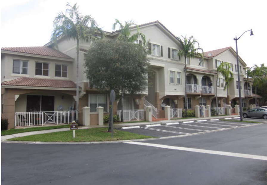
Rear View 06/14/2014