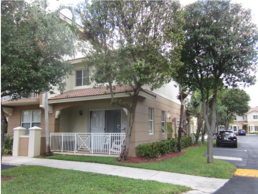
Left Side View 06/14/2014

If using the Elevation Certificate to obtain NFIP flood insurance, affix at least 2 building photographs below according to the instructions for Item A6. Identify all photographs with: date taken; "Front View" and "Rear View"; and, if required, "Right Side View" and "Left Side View".When applicable, photographs must show the foundation with representative examples of the flood openings or vents,as indicated in Section A8. If submitting more photographs than will fit on this page, use the Continuation Page.