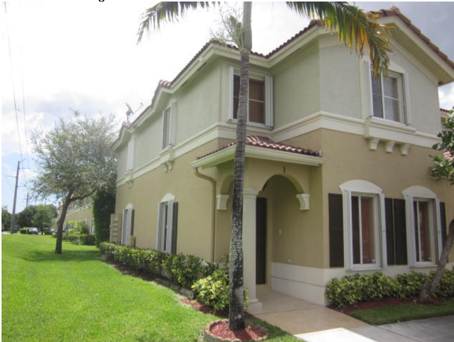
Left Side View 06/14/2014

If using the Elevation Certificate to obtain NFIP flood insurance, affix at least 2 building photographs below according to the instructions for Item A6. Identify all photographs with: date taken; "Front View" and "Rear View"; and, if required, "Right Side View" and "Left Side View". When applicable, photographs must show the foundation with representative examples of the flood openings or vents, as indicated in Section A8. If submitting more photographs than will fit on this page, use the Continuation Page.