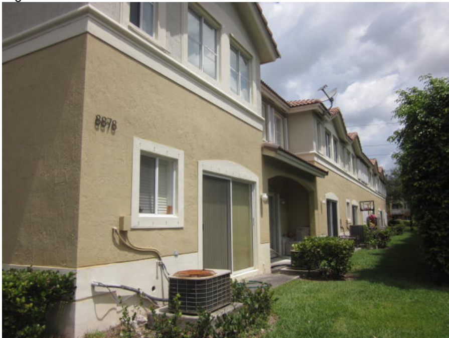
Rear View 06/14/2014