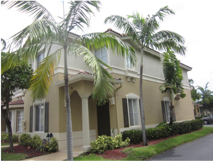
Right Side View 06/14/2014

If using the Elevation Certificate to obtain NFIP flood insurance, affix at least 2 building photographs below according to the instructions for Item A6. Identify all photographs with: date taken; "Front View" and "Rear View"; and, if required, "Right Side View" and "Left Side View". When applicable, photographs must show the foundation with representative examples of the flood openings or vents, as indicated in Section A8. If submitting more photographs than will fit on this page, use the Continuation Page.