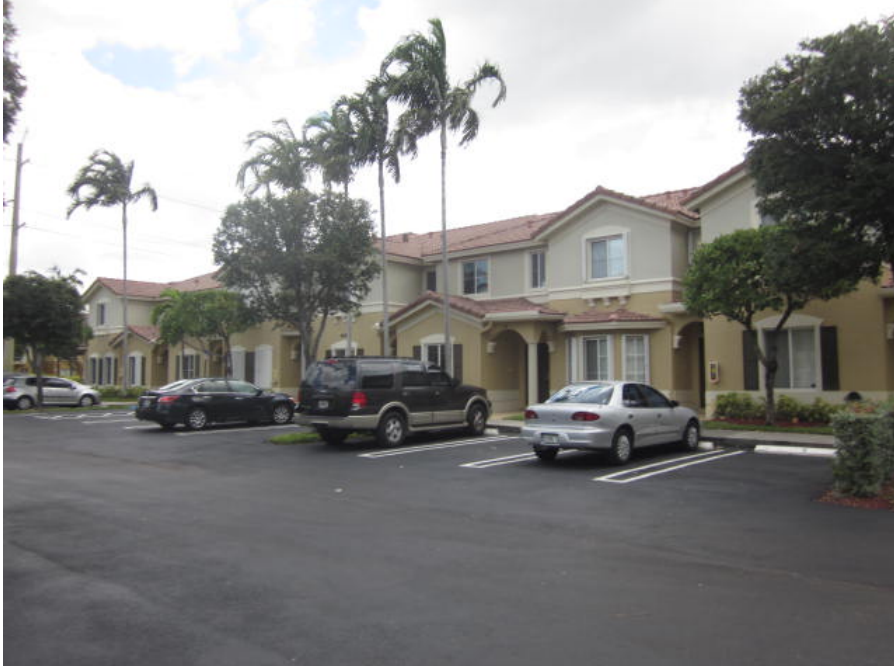
Front View 06/14/2014