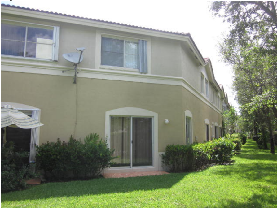
Rear View 06/14/2014