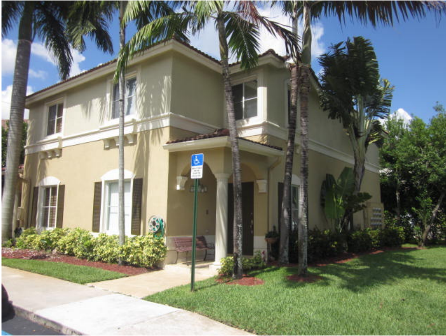
Right Side View 06/14/2014

If using the Elevation Certificate to obtain NFIP flood insurance, affix at least 2 building photographs below according to the instructions for Item A6. Identify all photographs with: date taken; "Front View" and "Rear View"; and, if required, "Right Side View" and "Left Side View". When applicable, photographs must show the foundation with representative examples of the flood openings or vents, as indicated in Section A8. If submitting more photographs than will fit on this page, use the Continuation Page.