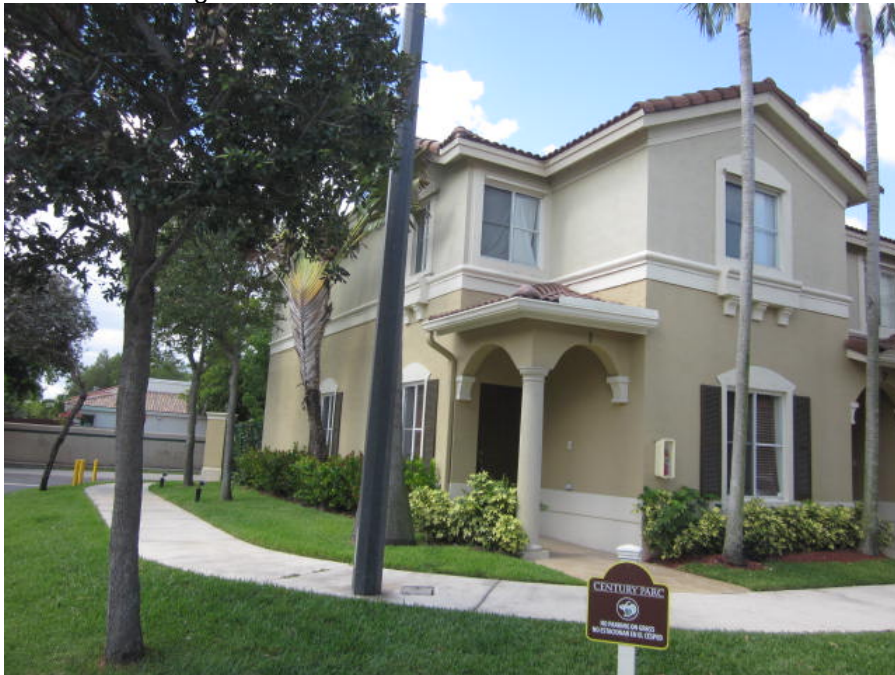
Left Side View 06/14/2014

If using the Elevation Certificate to obtain NFIP flood insurance, affix at least 2 building photographs below according to the instructions for Item A6. Identify all photographs with: date taken; "Front View" and "Rear View"; and, if required, "Right Side View" and "Left Side View". When applicable, photographs must show the foundation with representative examples of the flood openings or vents, as indicated in Section A8. If submitting more photographs than will fit on this page, use the Continuation Page.