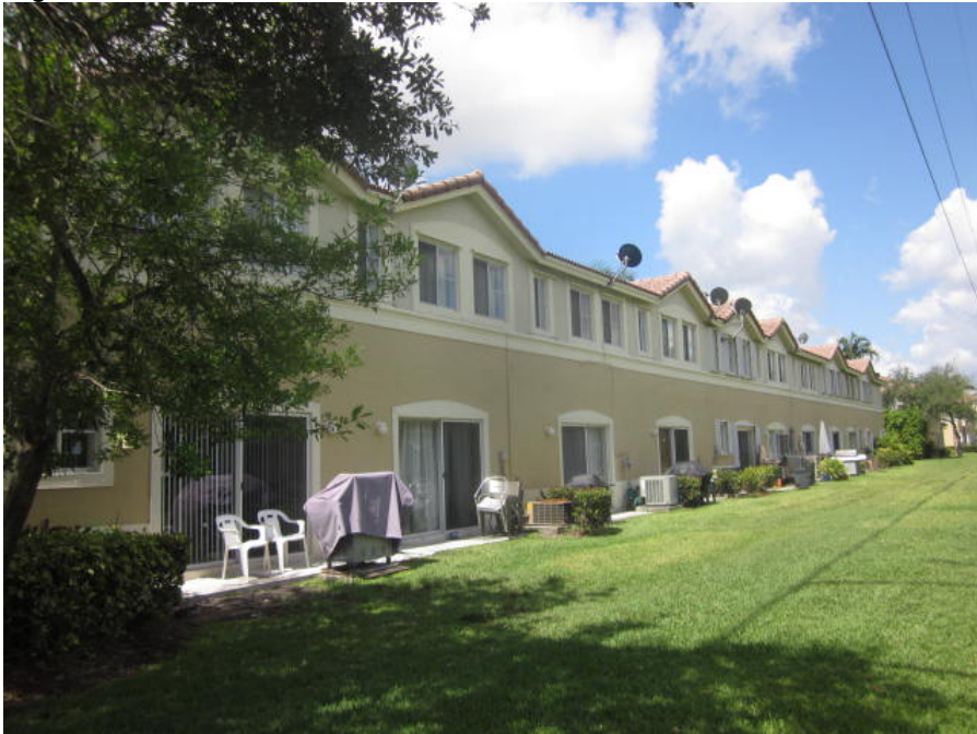
Rear View 06/14/2014