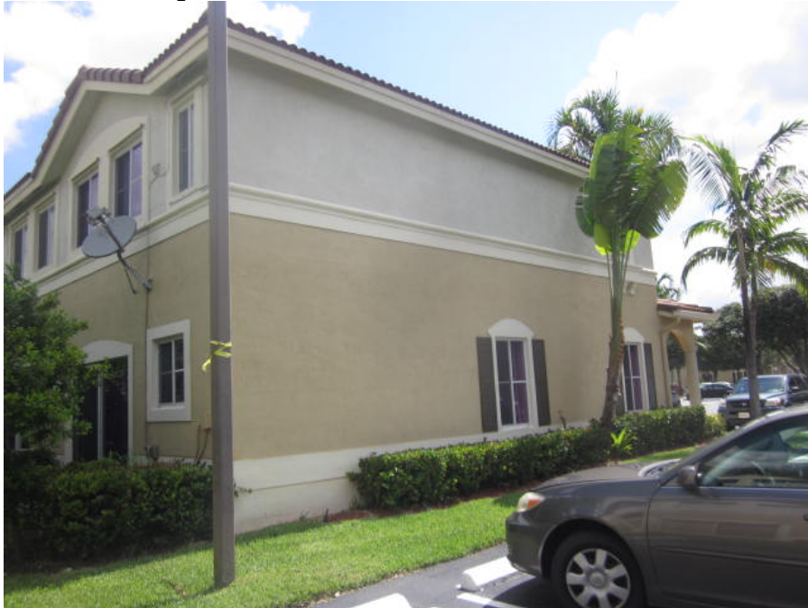
Left Side View 06/14/2014

If using the Elevation Certificate to obtain NFIP flood insurance, affix at least 2 building photographs below according to the instructions for Item A6. Identify all photographs with: date taken; "Front View" and "Rear View"; and, if required, "Right Side View" and "Left Side View". When applicable, photographs must show the foundation with representative examples of the flood openings or vents, as indicated in Section A8. If submitting more photographs than will fit on this page, use the Continuation Page.