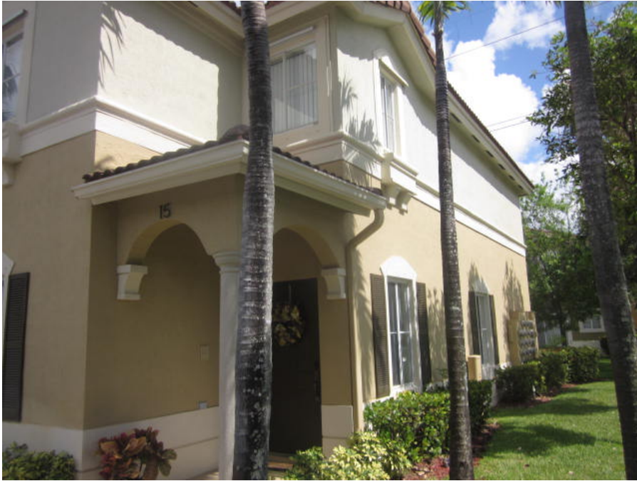
Right Side View 06/14/2014

If using the Elevation Certificate to obtain NFIP flood insurance, affix at least 2 building photographs below according to the instructions for Item A6. Identify all photographs with: date taken; "Front View" and "Rear View"; and, if required, "Right Side View" and "Left Side View". When applicable, photographs must show the foundation with representative examples of the flood openings or vents, as indicated in Section A8. If submitting more photographs than will fit on this page, use the Continuation Page.